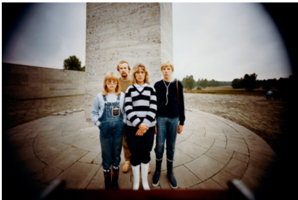
German family, Bergen-Belsen concentration camp, near Hannover, Germany, 1981

See more of James Friedman's work here http://www.jamesfriedmanphotographer.com