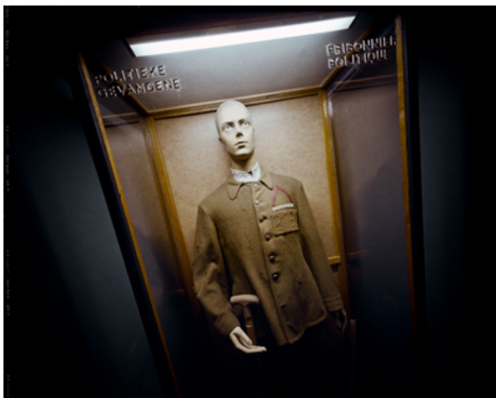
Mannequin of political prisoner, Fort Breendonck concentration camp, near Brussels, Belgium, 1981